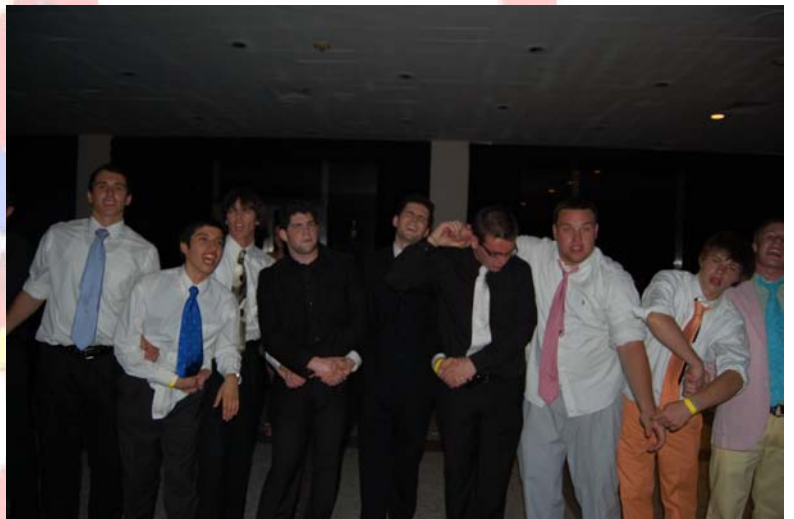
Some of the new members singing loving cup at Beta Ball 2010.