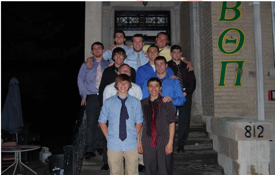
The new pledge class of Spring 2010. (Individual bios on next page)