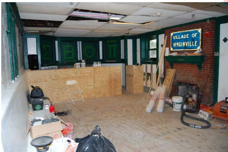
The basement in the middle of construction.